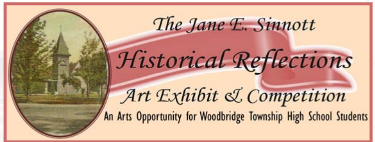
Exhibit will be presented in-house at the Barron Arts Center as well as virtually with link available April 30th on the Woodbridge Twp. Website and Barron Arts Facebook Page. Due to the ongoing pandemic, in-house BAC gallery visits will be limited to 25% capacity. There will be no artist reception or award ceremony this year. Category Winners Announced April 30 on Barron Arts Facebook Page.