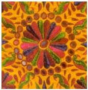
Exhibit: Weaving Traditions-Textiles of India On View March 5-26, 2021

This exhibit features Indian fabrics and textile techniques like Khadi silk, Kutch embroidery, Ikat, Batik and Jamdan fabrics.